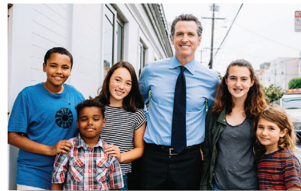
GAVIN NEWSOM for Governor