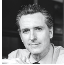
Governor Gavin Newsom